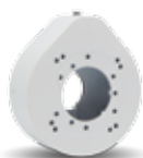
Junction Box (PR-B37JB) is available

Sensor: 1/3" Sony, 2 Mega-Pixel Selectable Output: 1080P AHD / CVI / TVI / Analog Lens: 2.8mm Mega-Pixel Fixed True Day & Night – ICR IR Range: 15m (19 Wide IR LED ) IP66 CoC Support Weight: 270g Power: DC 12V, ~310mA