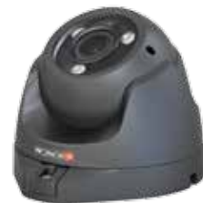
Available in Grey Color